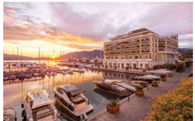
PORTO MONTENEGRO YACHT CLUB