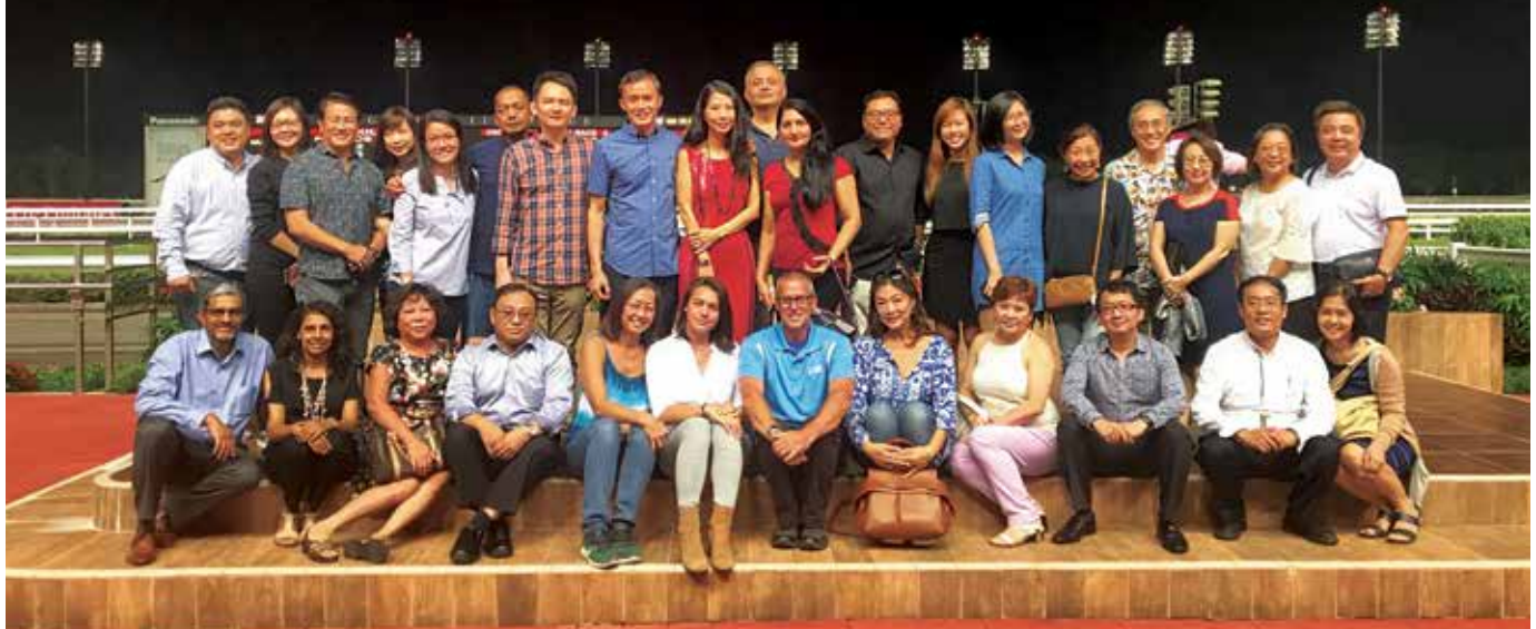
MEMBERS POSE FOR A COMMEMORATIVE SNAPSHOT OF AN EVENING WELL-SPENT