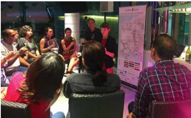
PARTICIPANTS LISTEN INTENTLY AS THE BASICS OF WINE APPRECIATION ARE EXPLAINED

Good wine is one of life's greatest pleasures, and on 9 November, some of our Members took the first step towards becoming wine connoisseurs at a wine tasting session conducted by The French Cellar. Savouring four different varieties of wine, participants were taken through the basics of wine appreciation, learning about methods of identifying distinctive wine characteristics, ideal food pairings, serving temperatures and appropriate lengths of storage. Members ended the event on a satisfying note as they put their skills to the test in a fun-filled challenge to detect the aroma compounds in an unknown wine. 🍷