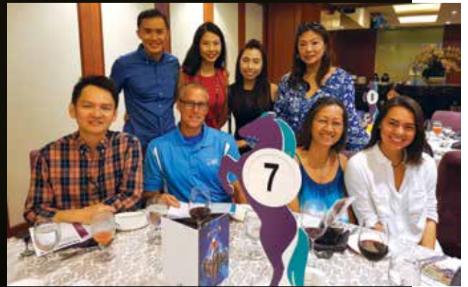
AN EVENING MADE PERFECT WITH GOOD FOOD AND DELIGHTFUL COMPANY