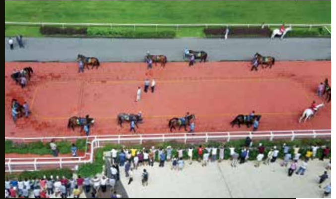
A BIRD'S-EYE VIEW OF THE ACTION

On 13 October, Members spent an exciting night out at the races at the Singapore Turf Club. Up in the Bukit Box, the unobstructed view of the action and exclusive outdoor area gave participants a taste of the electrifying atmosphere of horse racing. For many, it was a memorable and eye-opening experience as it was their first visit to the racecourse. Catching up with one another over dinner and drinks, Members also took the opportunity to get up close and personal to the horses and jockeys in a Parade Ring Tour. 📍