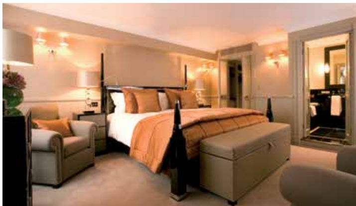
ST. JAMES'S HOTEL AND CLUB