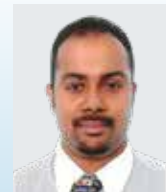
T. Shanmugaratnam Singaporean