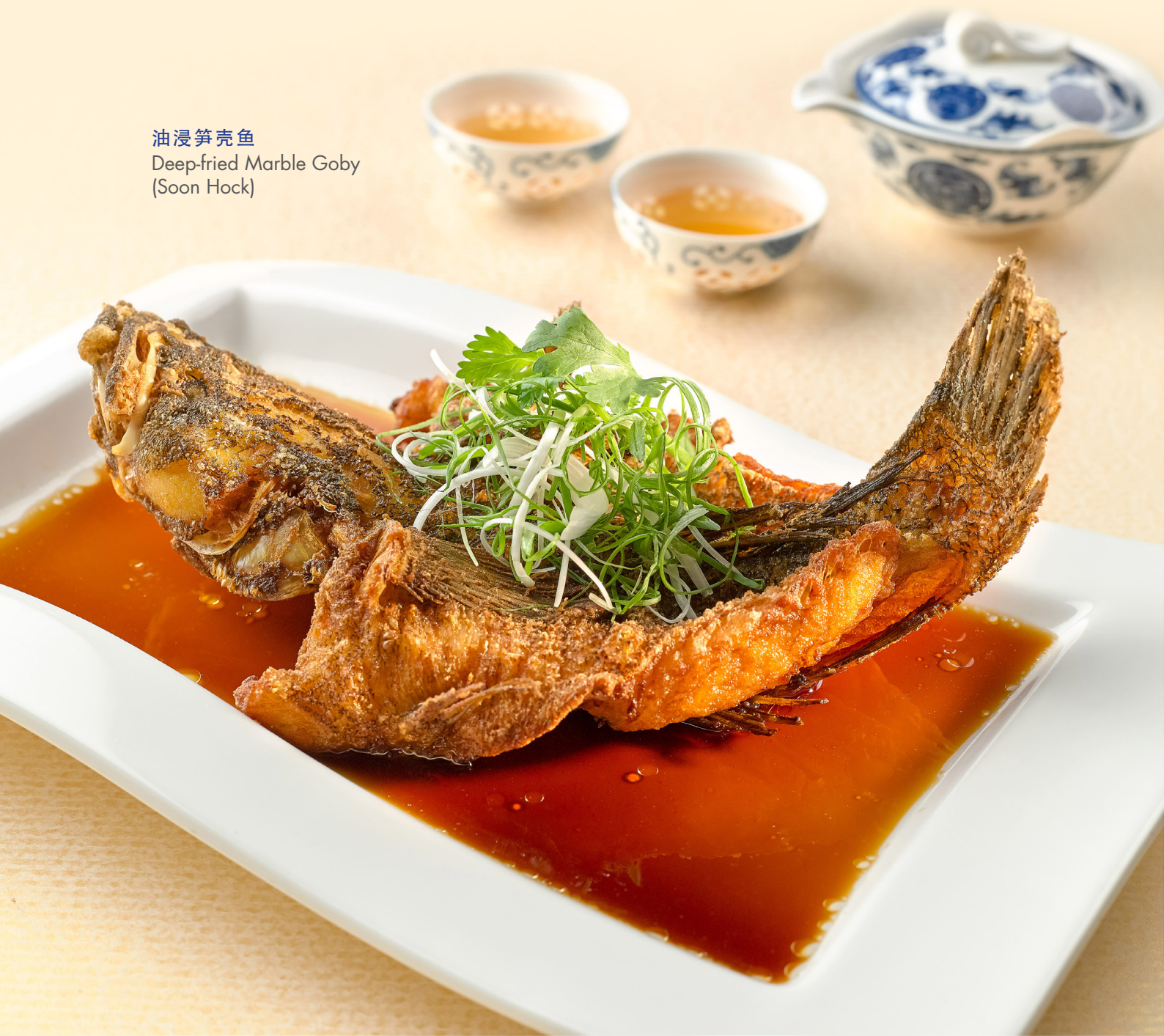
油浸笋壳鱼 Deep-fried Marble Goby (Soon Hock)