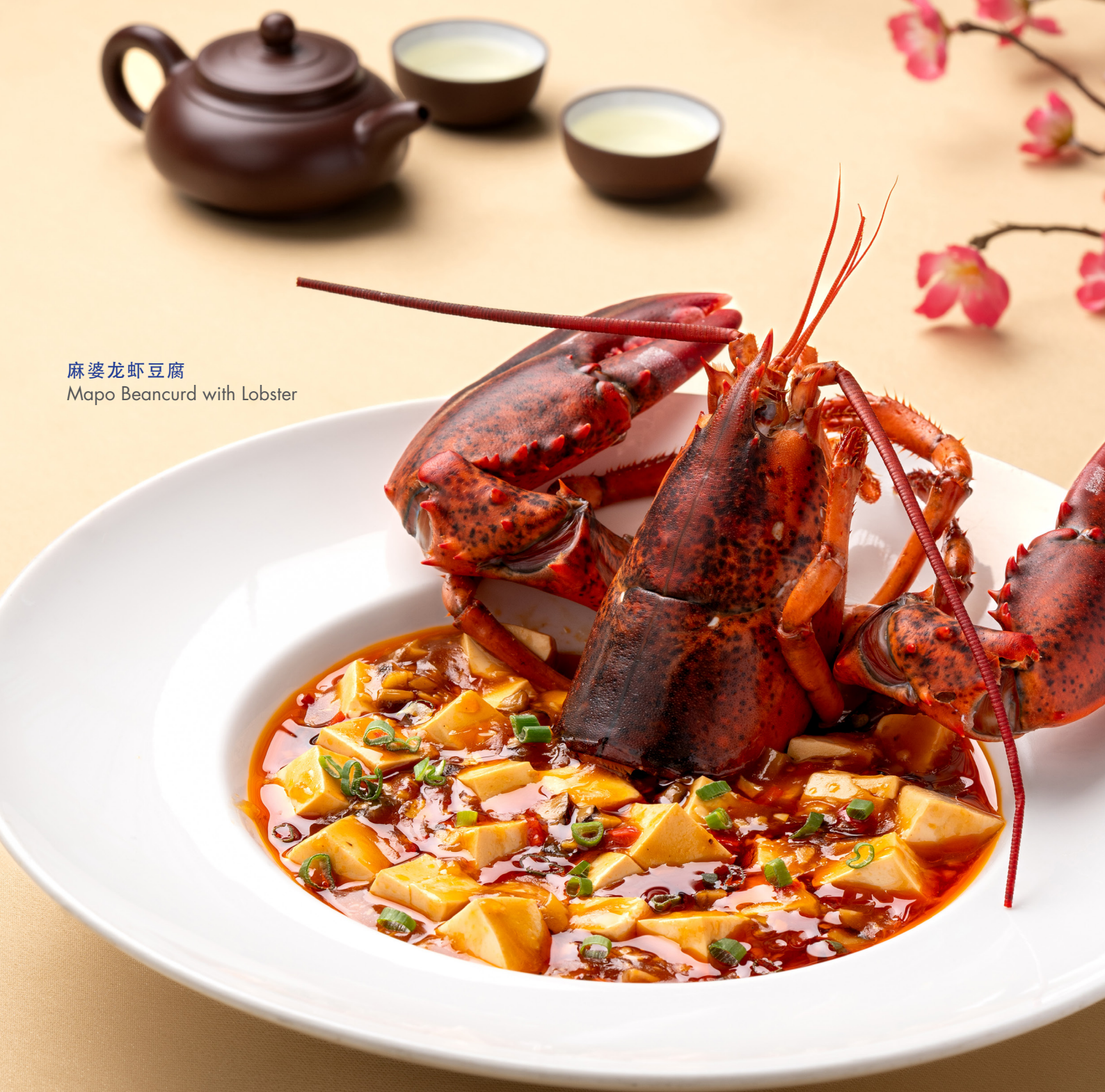
麻婆龙虾豆腐 Mapo Beancurd with Lobster