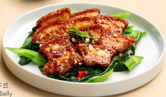
妙酱烧肉炒芥兰 Sautéed Pork Belly with Kai Lan