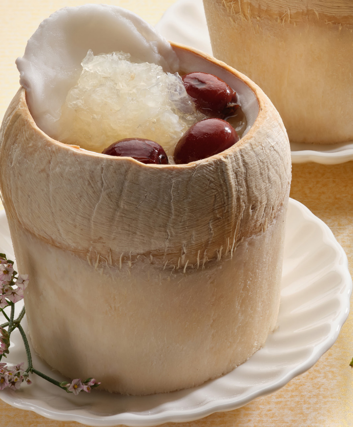
椰皇炖燕窝 Double-boiled Bird's Nest Served in Coconut