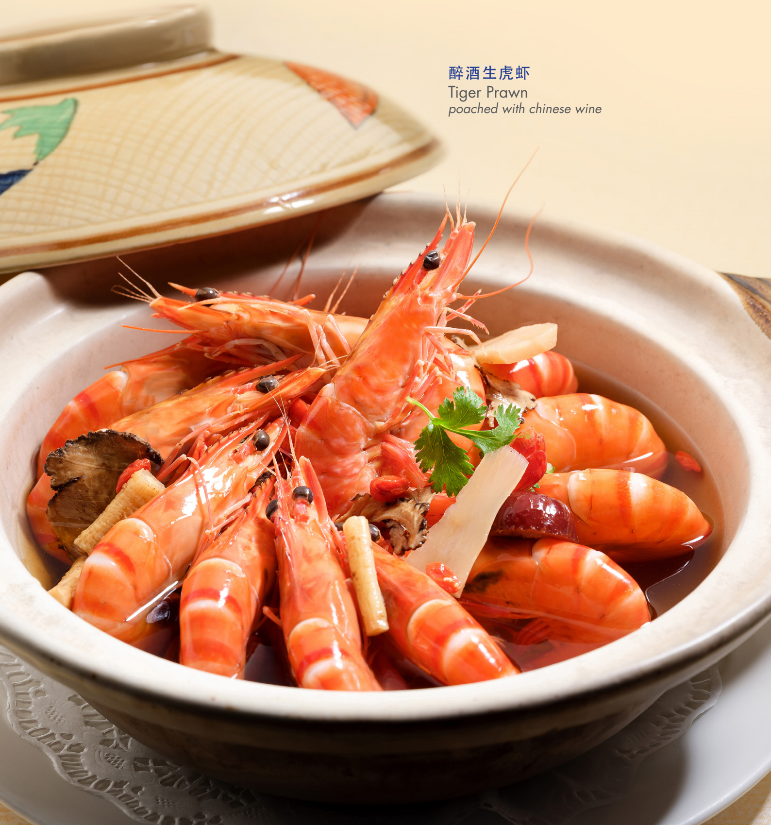
醉酒生虎虾 Tiger Prawn poached with chinese wine