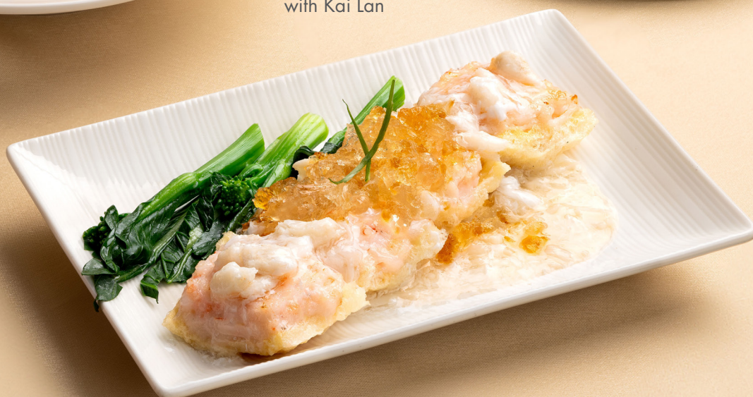
蟹肉桃胶百花酿鱼鳔 Braised Fish Maw, Crab Meat and Peach Gum