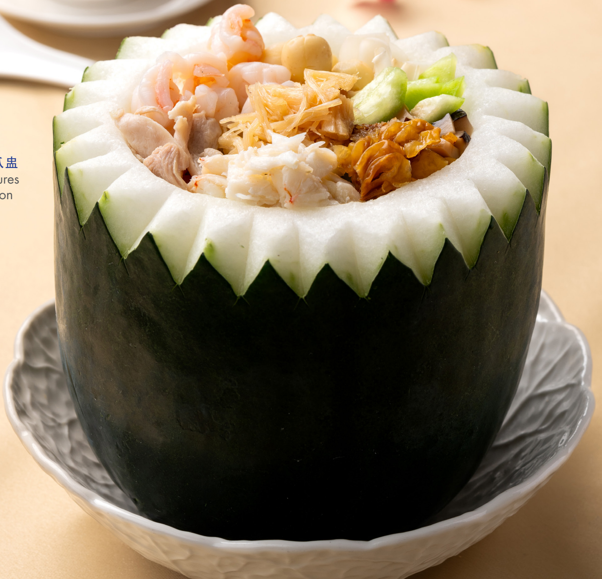
海鲜炖冬瓜盅 Eight Treasures Winter Melon Soup